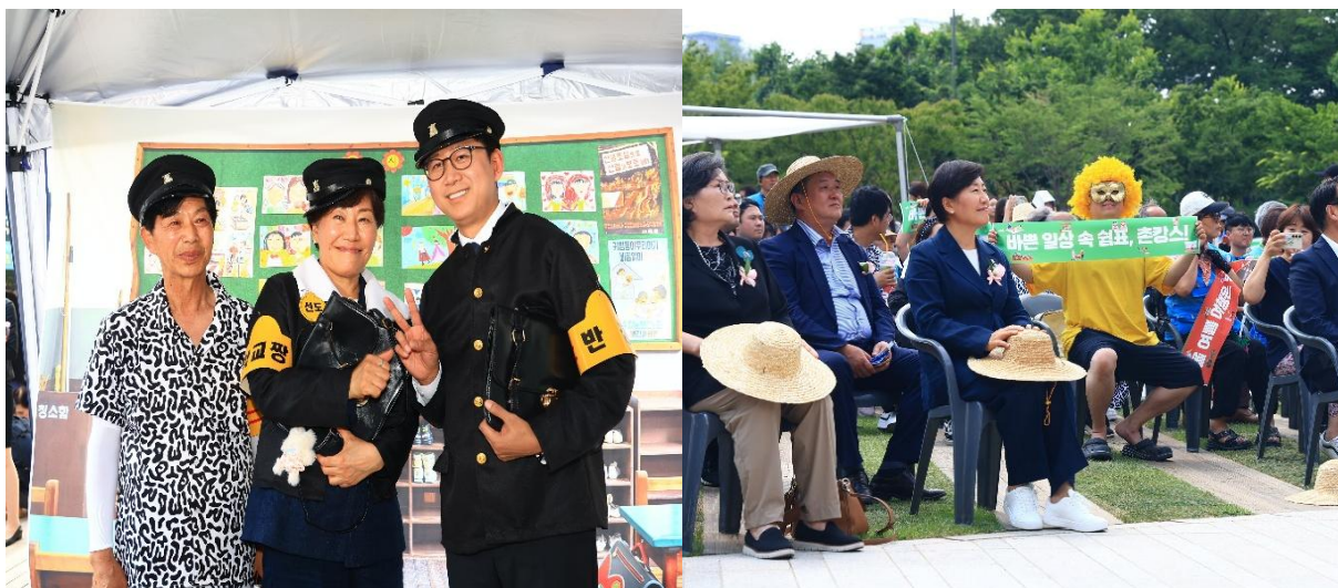
< Minister Song Miryung at the 2026 Rural Travel Festival >

Further information on rural travel and tourism is available on Welchon, the Rural Tourism Portal ( www.welchon.com ).