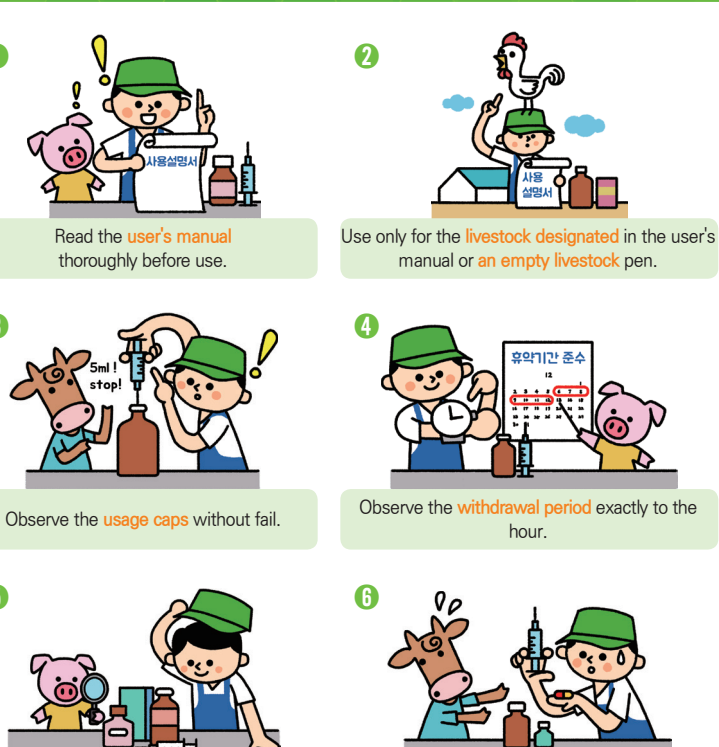
Observe the method of use (administration route) without fail